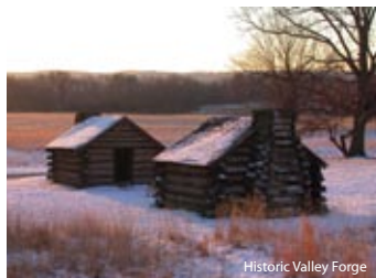
Historic Valley Forge