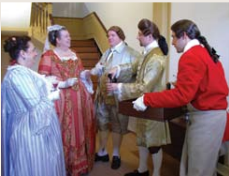
Pottsgrove Manor, decorated in period for the holidays.

year's collection will include a Plate de Haiti tomato—a variety that came to America in 1793 from Haiti—as well as Black Valentine bush beans, Moldavian Dragonhead, Carolina Lupin and many others. A small selection of rare tulip bulbs is also available for purchase. For more information call (215) 729-5281.