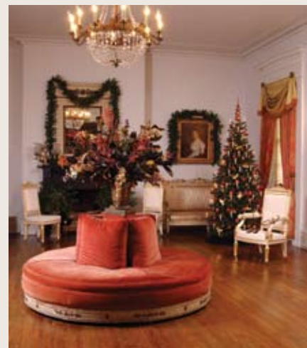
A decorated Strawberry Hill Mansion.

Holiday Yuletide Trolley tours of Historic Fairmount Park Houses run from Wednesday Nov. 28 through Sunday Dec. 14, from 10 a.m. to 4 p.m. Experience the splendor of Christmas at Cedar Grove, Lemon Hill, Strawberry Mansion, Mount Pleasant, Laurel Hill and Woodford . Yuletide Trolleys depart from the Italian Fountain Circle at Fairmount Waterworks. For more information visit www.laurelhillmansion.org .