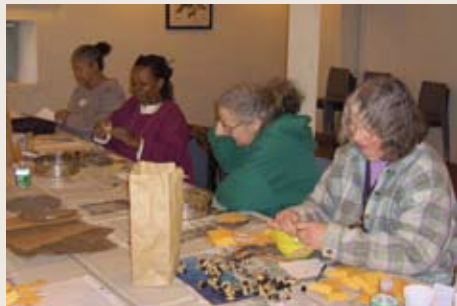
Bartram's Garden volunteers clean seeds collected from the site's gardens

Bartram's Garden , in Philadelphia , has some unique seeds for sale. Every year, seeds are collected from the grounds, cleaned by volunteers and sold at the museum shop. This