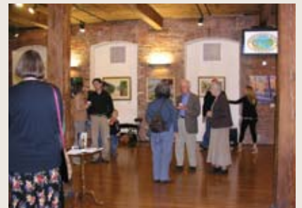
Scenes of the Schuylkill Reception at MCCC’s West Campus Art Gallery on 16 High Street

Calendars are available for $10. To order calendars call the SRHA offices at (484) 945-0200.