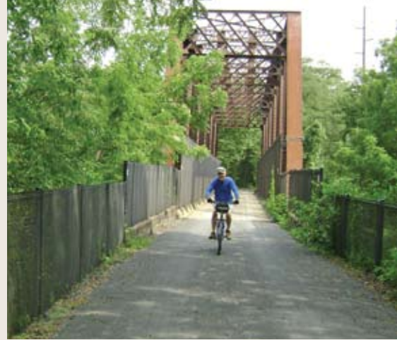
The Bartram Trail has interesting features that are interpreted in signs along its length.

"This represents a crucial development for the