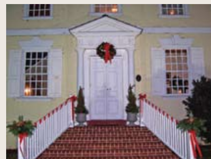
Laurel Hill Mansion in holiday finery.

For more information visit www.2montcopa.org .