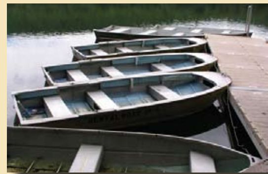
A line of boats at Tuscarora State Park