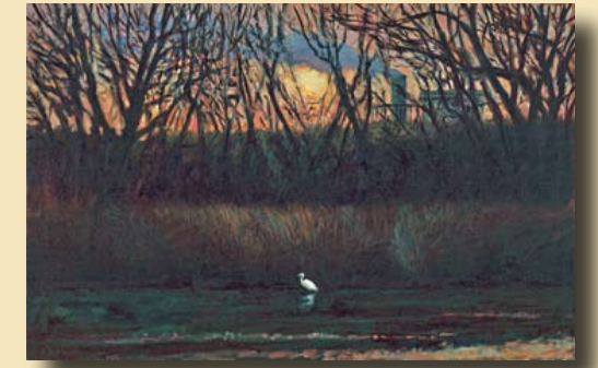
Solitary Egret by Charles Cushing, 2006's Scenes of the Schuylkill selected artwork.