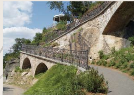
Before (upper) and after (lower) pictures of the restored Cliffside Path leading from the Fairmount WaterWorks to the Philadelphia Art Museum