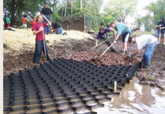
Scouts put into place the reinforcing GeoWeb

School. He organized the project through the SRHA, which has a grant from the PA Department of Conservation and Natural Resources to improve access to the river.