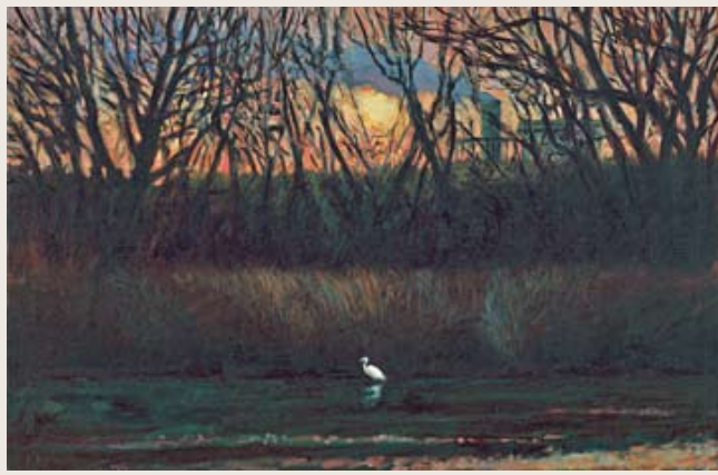
Scenes of the Schuylkill 2006 Selected Painting: Charles Cushing's Solitary Egret, Tinicum Marsh