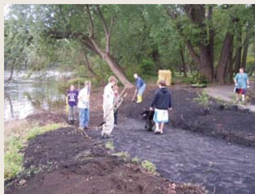
Canoe ramp site after excavation

Hampton, 17, is a senior at Pottsgrove High