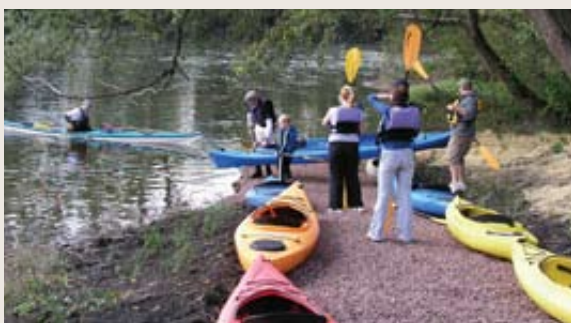
Novice kayakers wait their turn to get their (kayaks’) bottoms wet in the Schuylkill River.

The new packed gravel trail section begins where the existing trail once ended, at the Berks/Montgomery County line, and connects to